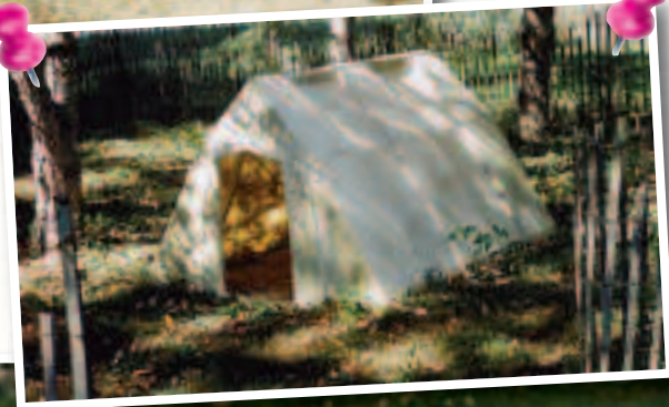
Below: The Overtons Geese