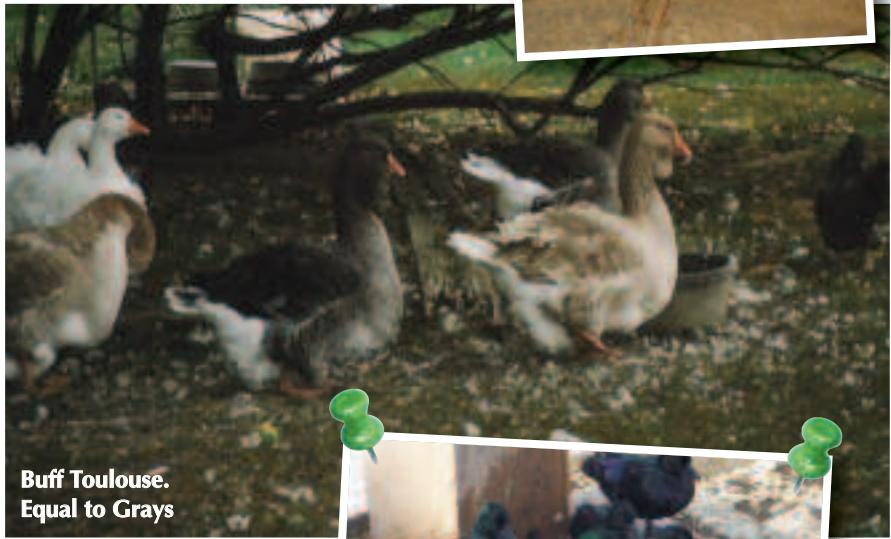
Buff Toulouse. Equal to Grays