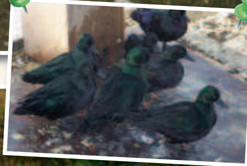
Right: Lou's East Indies